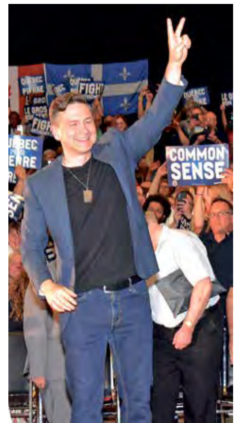
Conservative Party leader Pierre Poilievre flashes a V for victory sign during a pre-election year Quebec campaign launch held at a Jewish community centre in Montreal on June 19.

"When people are going through difficult moments, whether financial or over human rights, they turn out to vote," he added. "So, I hope that when they are having difficulties and are seeing others suffering and the nation is divided, they will use their democratic right to voice their concerns and bring about change."