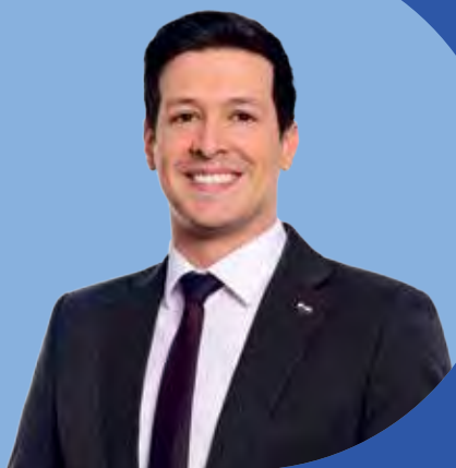
Stéphane Boyer Mayor of Laval