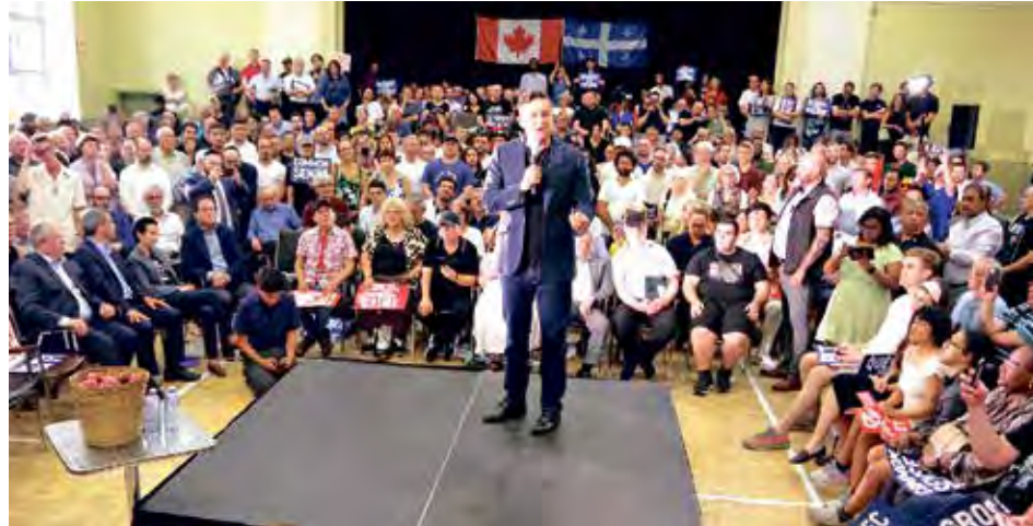
Addressing a packed auditorium in Montreal's west end, Conservative Party leader Pierre Poilievre urged voters to vote Conservative and oust Prime Minister Justin Trudeau's administration.

"He tries to divide people over their wealth, their religion and their language. And he is a prime minister who has tried to divide people for nearly a decade ... And why is he trying to